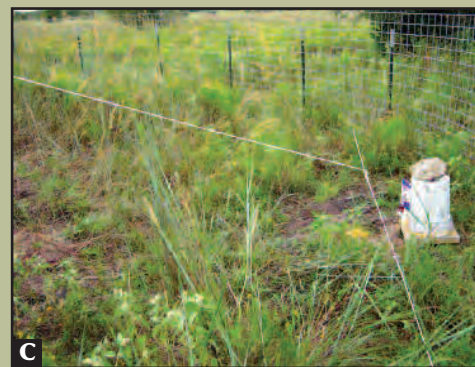
A board is used as a prop on a swing gate (A). T-posts guide the wire from the prop to the back of the trap (B). The wire is then attached to another wire forming a T-intersection at the trigger point (C). As the hogs feed on the bait, the wire is stretched, and the prop pulls from the gate..