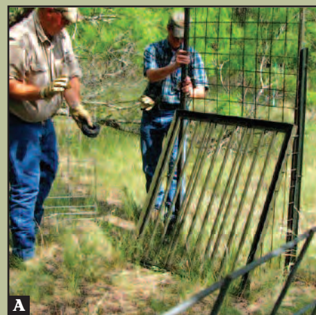
Use steel T-posts to secure a head gate (A). Make sure the head gate fits snugly against the T-posts using a doubled strand of baling wire (B).