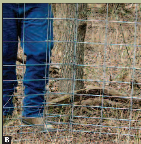
A panel secured to a head gate T-post with doubled wire (A). The remaining panels are attached to one another. It is important to overlap the ends of the panels (B).