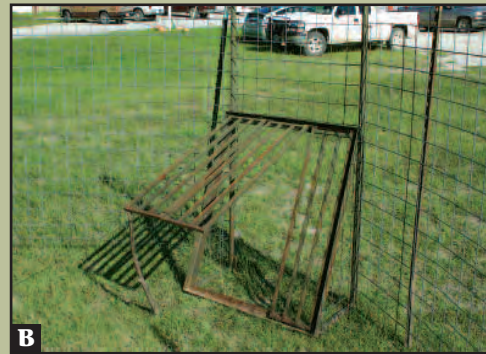
Swing gates require springs for closing (A). Lifting doors can be set in an open position like a drop gate, and once triggered, more hogs can push their way inside the trap (B). After triggering, the gate will close but permit more hogs to enter.