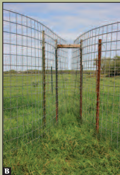
As hogs gather in the chute, they will push their way inside the trap (B).