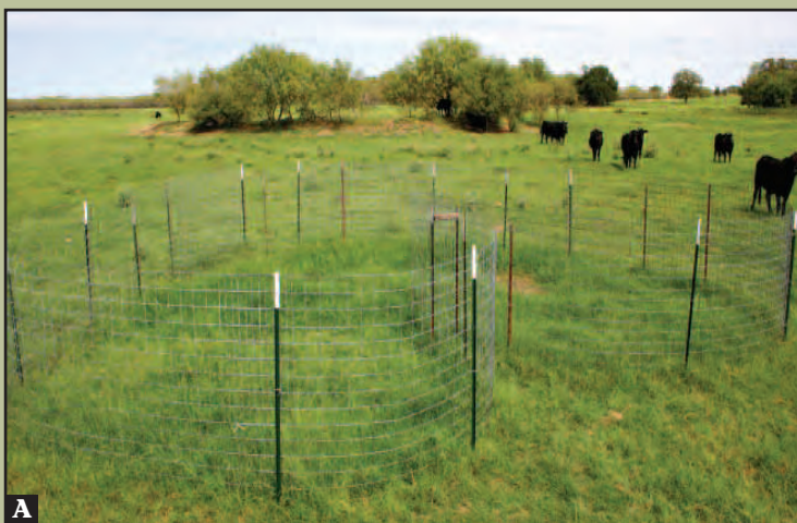
Heart-shaped or Wexford trap. The number of T-posts used depends on the trap's size and configuration (A).